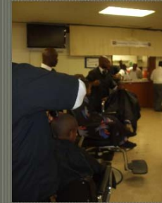
Brothers from the 12 th Masonic District give youths grooming tips and provided them with haircuts