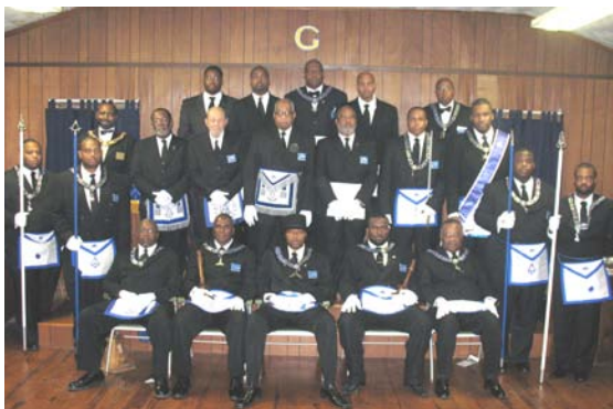
2010-2011 Elected and Appointed Officers of Carey Wheaton Lodge #307